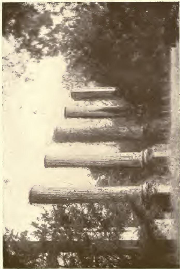
RUINS OF MILLWOOD, WADE HAMPTON'S ANCESTRAL HOME.